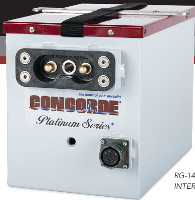
RG-145-2 features an INTERNAL DC HEATER